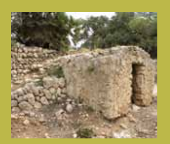
Tithe grain store