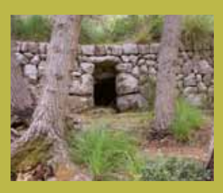
Font des Obis