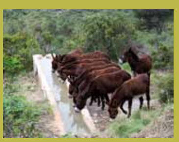
Sa Font des Poll